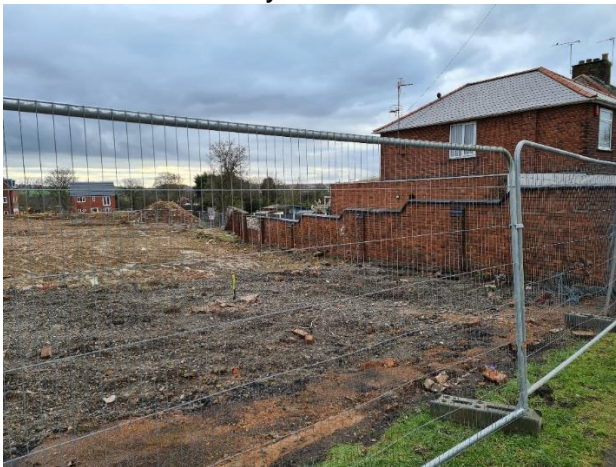
West boundary of site with No:40 Brookhill Leys Road.