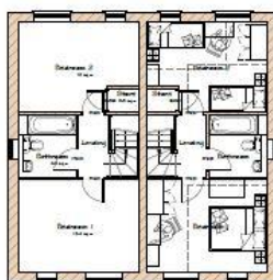
PROPOSED FIRST FLOOR PLAN - PLANTER BLVD