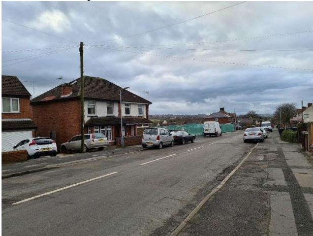
View from the east within Brookhill Leys Road.