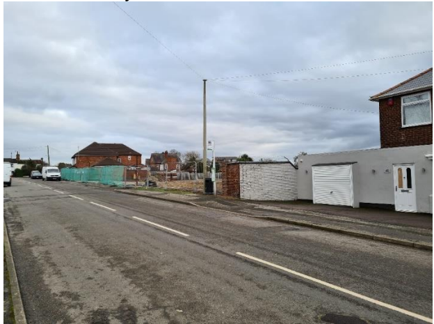
View from the west within Brookhill Leys Road.