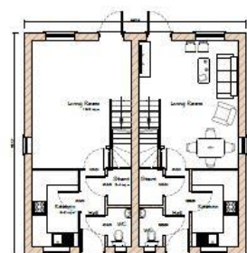
PROPOSED GROUND FLOOR PLAN, PAGES 6-8